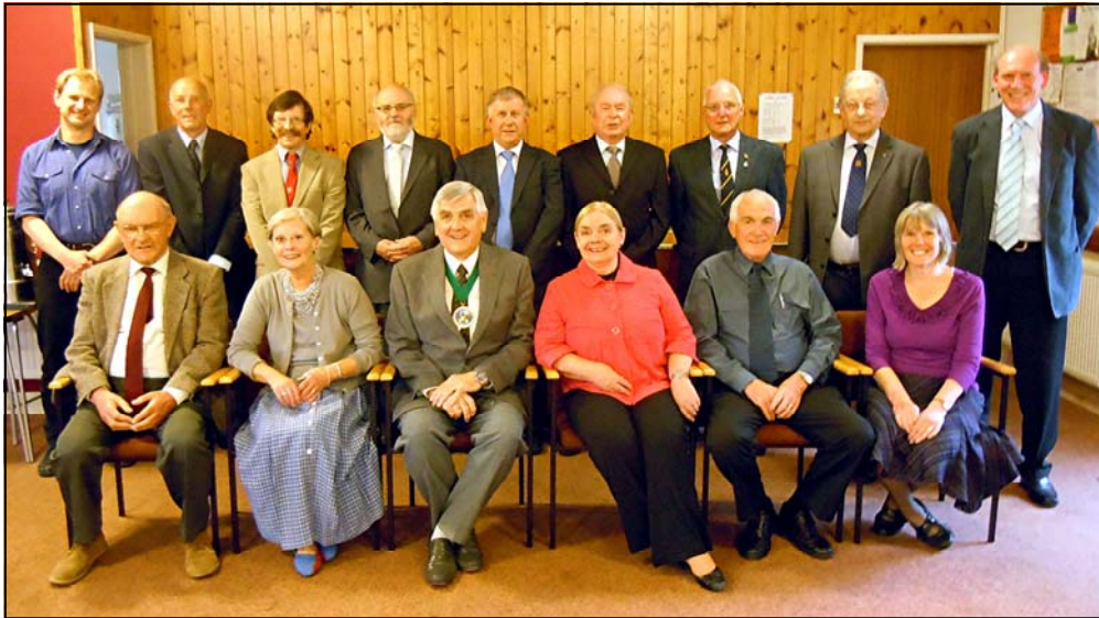
Leiston-cum-Sizewell Town Councillors at their first meeting after the May elections

Fairtrade Easter Egg Hunt results and picture on page 20