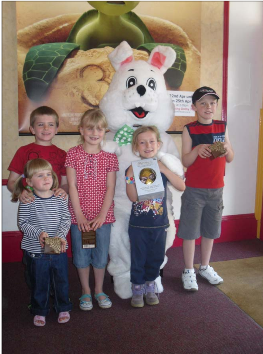
Leiston-cum-Sizewell Town Council Fairtrade Easter Egg Hunt